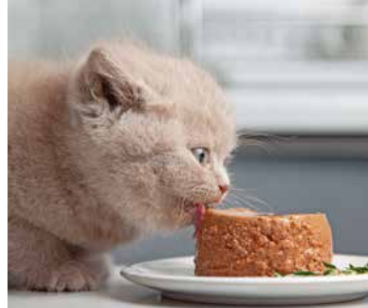
Wet pet food